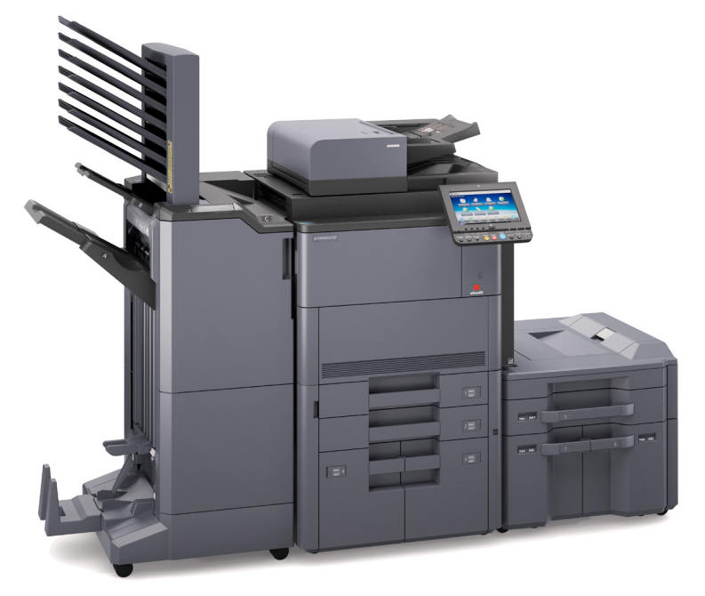
The d-Copia 8001MF with PF-740+PF-7130+DF-7110+MT-730+BF-730 Options