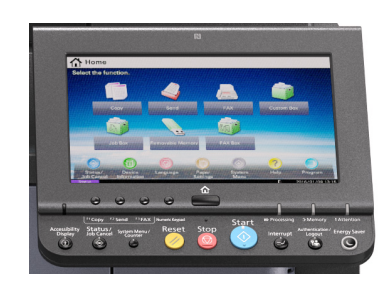
9" Touch-screen Panel